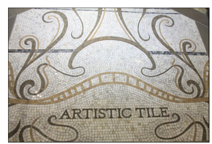
Artistic Tile Showroom Trostrud Mosaic & Tile Co., Inc.