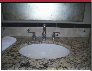
Hawthorn Woods Country Club G.M. Sloan Mosaic & Tile Co.