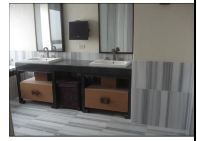
246 Spring Street Port Morris Tile & Marble Corp.