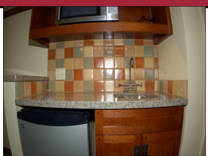
Disney Grand California Hotel Expansion Selectile of California, Inc